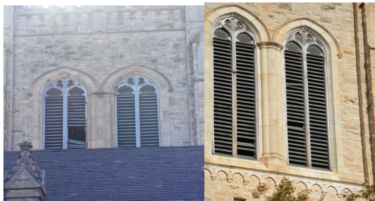
Figure 2-3 Damaged louvers on the Marshall Building bell tower, east view.

Earlier that week, a storm had damaged the bell tower, dislodging many slats from the louvers on each side of the tower. Northern Oklahoma College – Enid (NOC-Enid) mitigated the risk of injury from falling slats by closing the main entrance.