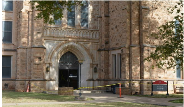
Figure 1 Safety tape blocks main entrance to the Marshall Building.

Phillips University alumni and friends who attended Vespers on Friday, June 23 were greeted by safety tape blocking the main entrance to the Marshall building.